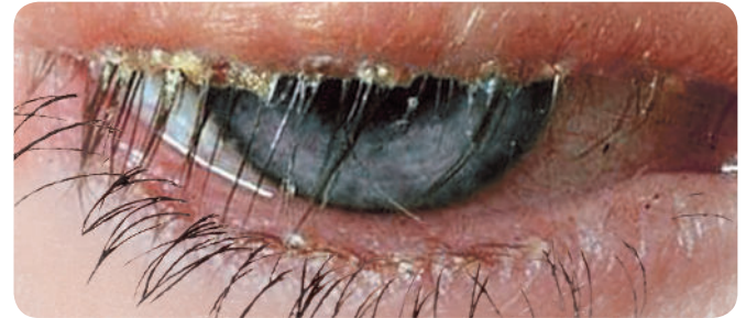
Sore, red, inflamed eyelids; crusty eyelashes

Sometimes, people will experience both types of Blepharitis because the causes are often connected.