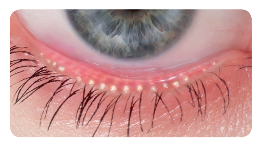
Blocked Meibomian glands