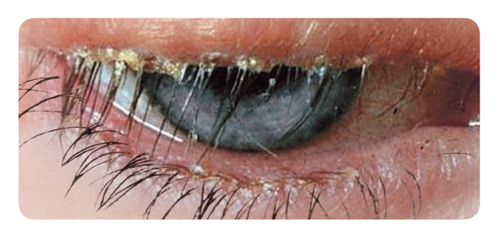
Sore, red, inflamed eyelids; crusty eyelashes

Sometimes, people will experience both types of Blepharitis because the causes are often connected.